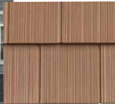
7" Perfection Shingle